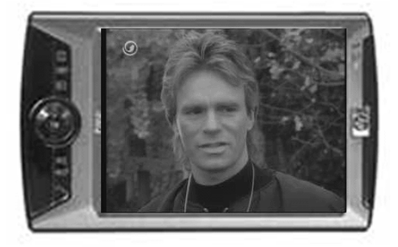
Figure 2 — DVB stream adapted to a PDA.

We have described an approach and a prototype implementation that receives and maps DVB